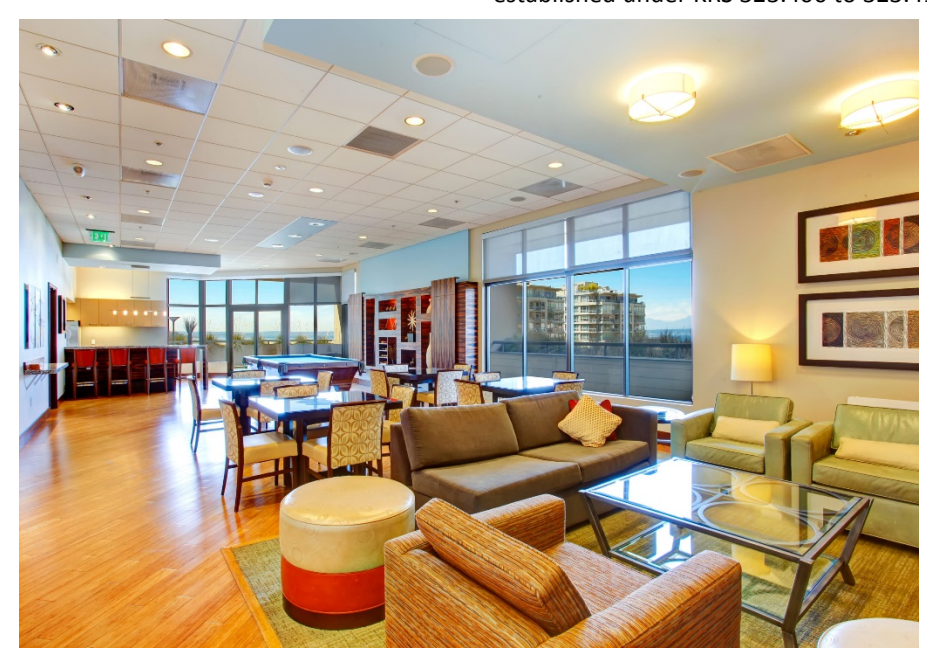
Norwood Kentucky - Interiors

KRS 323.402 Use of title indicating certification -- Performance of services by person not certified. (1) No person shall use the title "certified interior designer," the letters CID, or any acronym, abbreviation, or title that would imply certification under this chapter unless the person at the time holds a valid certificate to use the title "certified interior designer" in the Commonwealth of Kentucky as established under KRS 323.400 to 323.416 and 323.992.