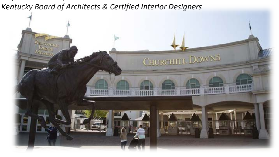
Churchill Downs, Louisville, Kentucky