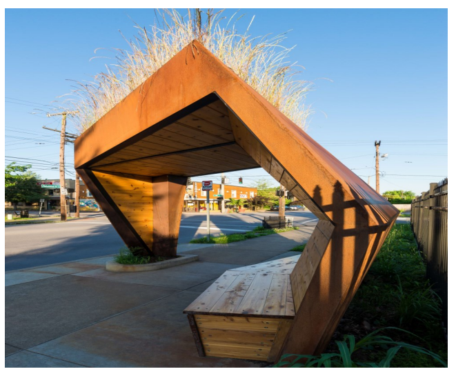
SmART Stop #2, Louisville, Kentucky

It has a large assembly space and tasting bar, the building provides a flexible-use private meeting or green room, catering kitchen, and waterside patio. A Luckett & Farley design, this site is an extension of the bourbon's urban distilling campus in downtown Louisville.