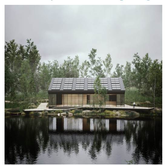
Rabbit Hole Tasting Room and Event Space

It has a large assembly space and tasting bar, the building provides a flexible-use private meeting or green room, catering kitchen, and waterside patio. A Luckett & Farley design, this site is an extension of the bourbon's urban distilling campus in downtown Louisville.