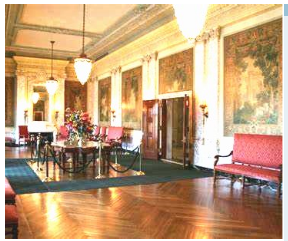
The State Reception Room of the Kentucky Capitol