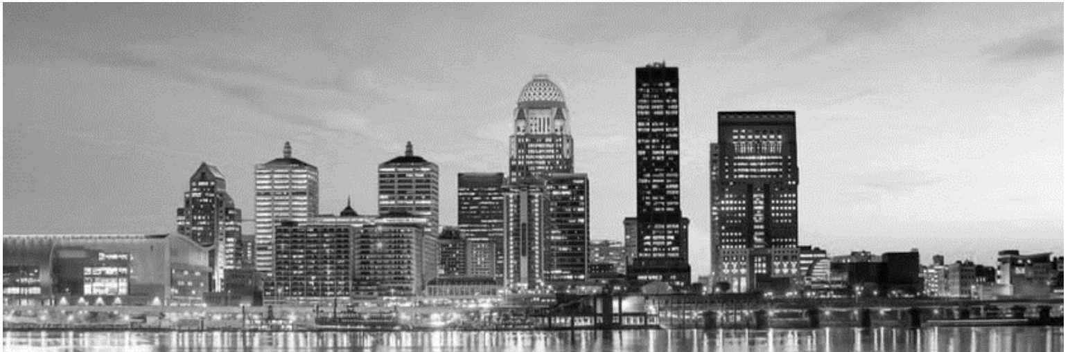
Cityscape of Louisville, Kentucky