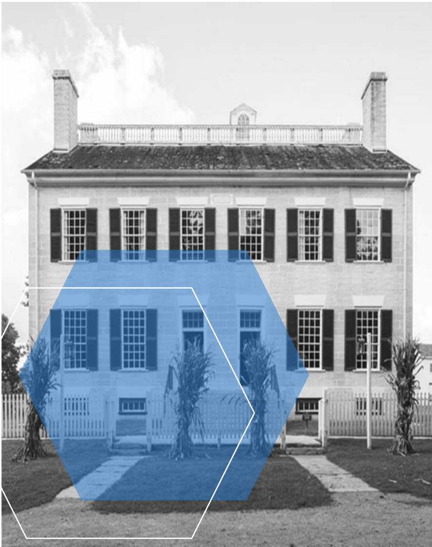
Shaker Village of Pleasant Hill, Harrodsburg, Kentucky

The Kentucky Board of Architects and Certified Interior Designers licenses and regulates the profession of Architecture in the Commonwealth of Kentucky. Unique among creative and artistic professions, the foremost purpose of any architect is to provide functional, healthful, safe, and pleasing shelter for human activity. Due to the degree of risk inherent in the design of structures, Architects require a significant amount of formal education. After obtaining a National Architectural Accrediting Board (NAAB) accredited degree, aspiring architects must also complete a multi-year experience program and pass a comprehensive multi-division exam. After becoming Architects, they must maintain their license by certifying annually, they have met 12 continuing education units pertaining to the health, safety, and welfare of the public. For more information on Kentucky Licensed Architects, or to find a licensed Kentucky Architect, please visit our website at BOA.KY.Gov